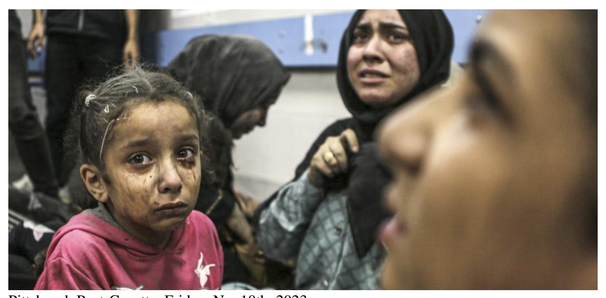
Pittsburgh Post-Gazette, Friday, Nov10th, 2023