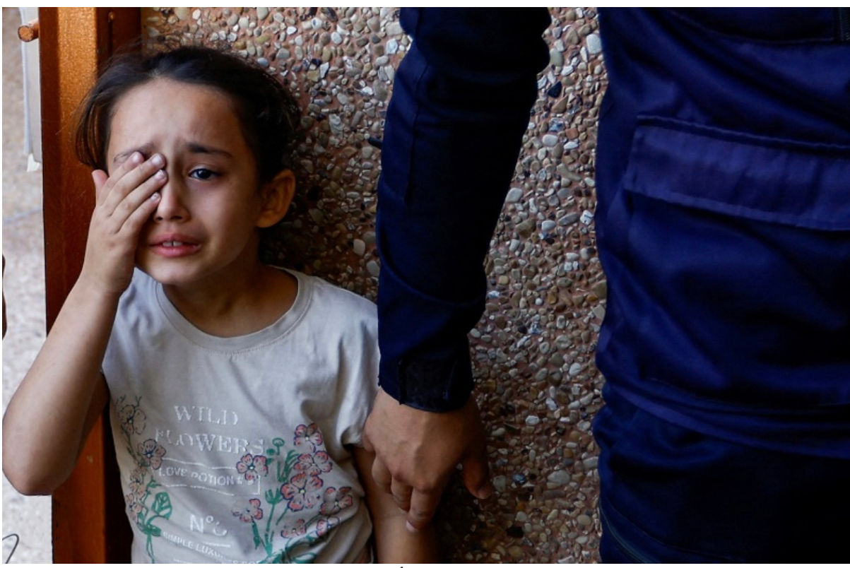
REUTERS, Ibraheem Abu Mustafa, Oct 12th, 2023